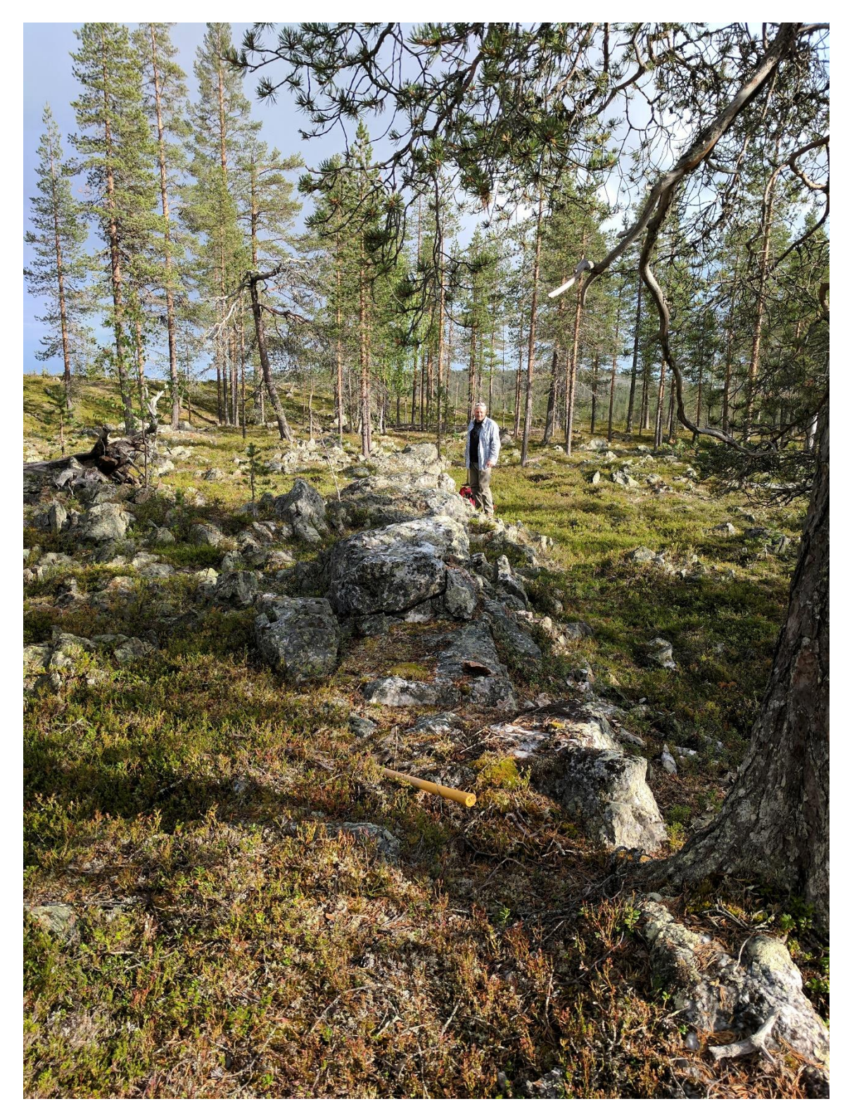
Large outcropping quartz vein, Launi East Project