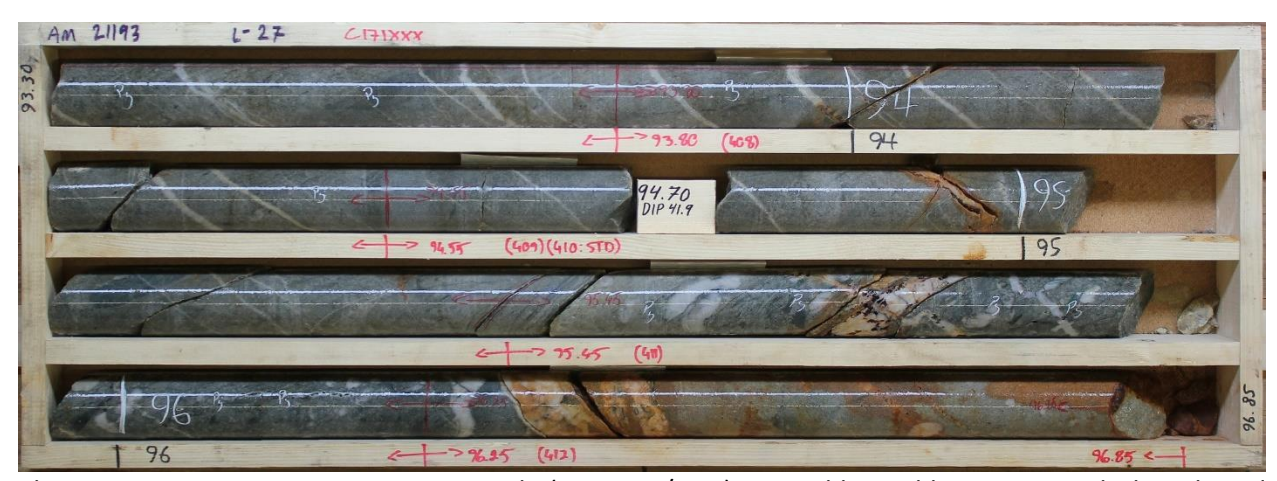
Photo 5. AM21193, Gap Zone. Lower grade (0.1-0.4 g/t Au) interval hosted by sericite and silica altered clastic sediment with pyrite dissemination.