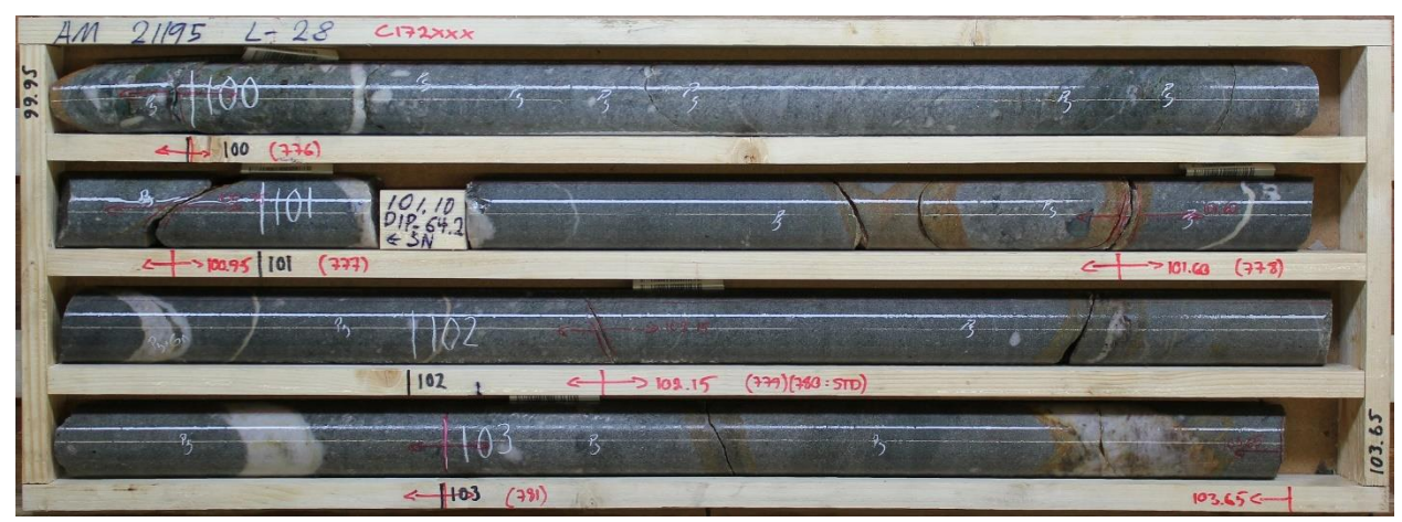
Photo 2. AM21195, NW Zone. Lower grade (0.1-0.5 g/t Au) interval hosted by sericite and silica altered clastic sediment with pyrite dissemination.