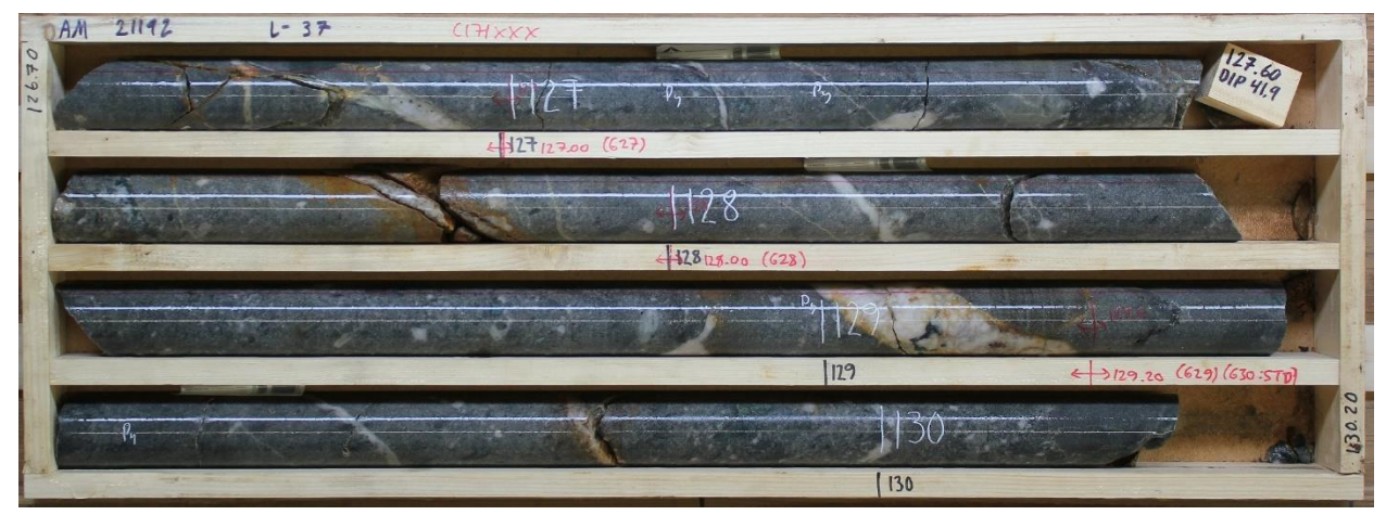
Photo 4. AM21192, Gap Zone. Lower grade (0.1-2.4 g/t Au) interval hosted by sericite and silica altered clastic sediment with pyrite dissemination.