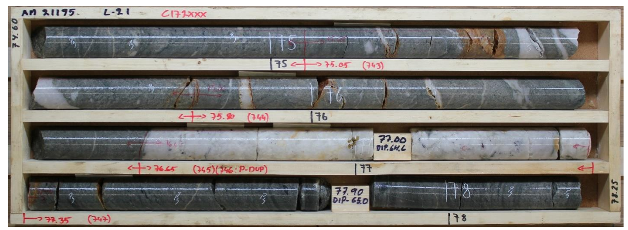
Photo 1. AM21195, NW Zone. High grade vein (70.1 g/t Au over 0.70 m) within lower grade (0.1-0.2 g/t Au) interval hosted by sericite and silica altered clastic sediment with pyrite dissemination.