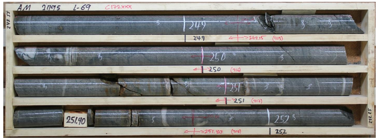
Photo 2. AM21195, NW Zone. Lower grade (0.1-0.3 g/t Au) interval hosted by sericite and silica altered clastic sediment with pyrite dissemination.