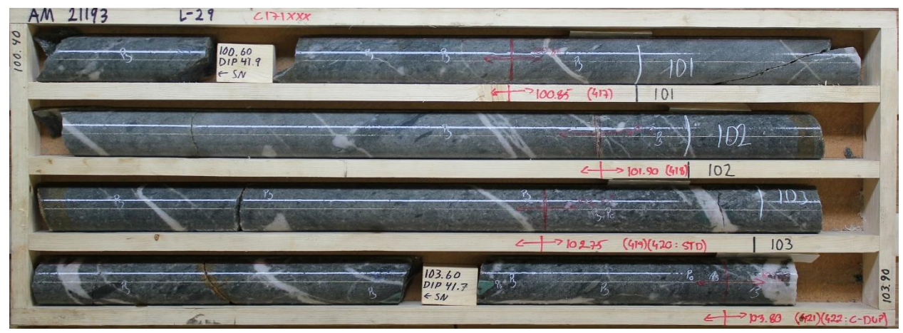
Photo 6. AM21193, Gap Zone. Lower grade (0.2-1.7 g/t Au) interval hosted by sericite and silica altered clastic sediment with pyrite dissemination.