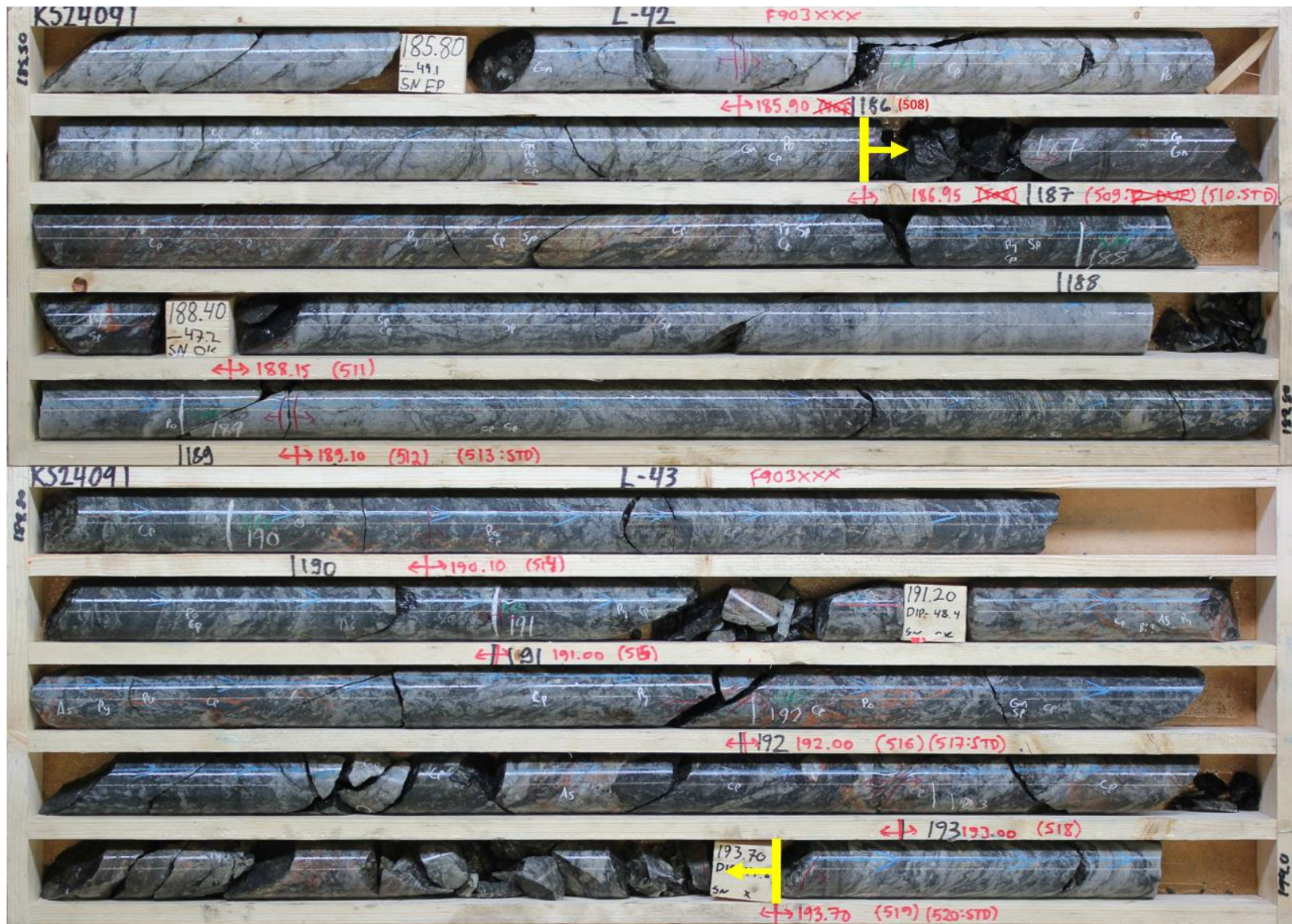
Figure 4: Gold mineralization, 8.08 g/t Au over 6.75 m from 186.95 m, in drill hole KS24091. Vanha prospect, Kaaretselkä area, Risti property